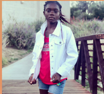
The Warmth of Family